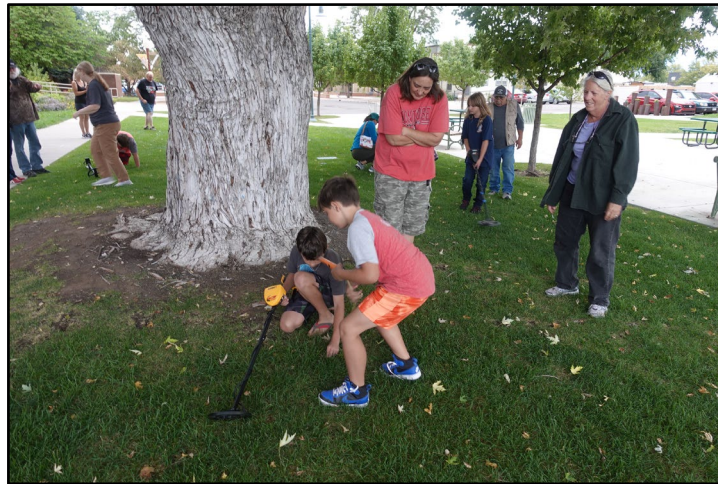
Club members introduce metal detecting to kids at Montrose Library