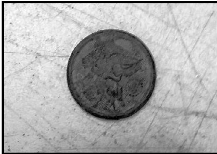
Find of the Month Army hat button by Don Rodarte