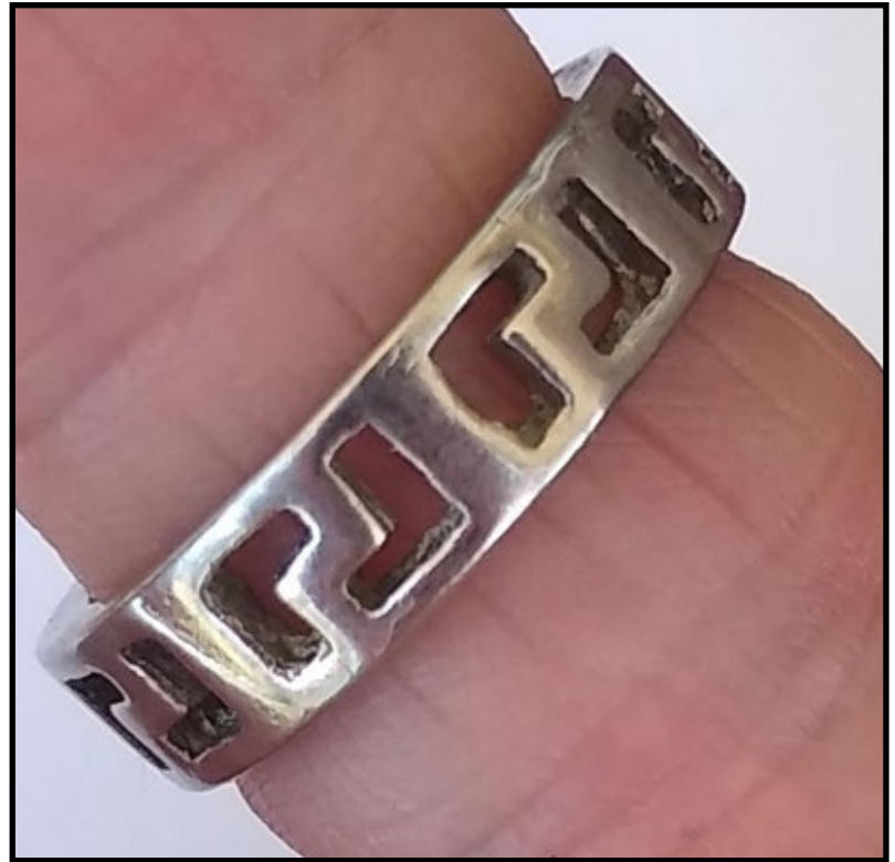
Find of the Month stainless steel ring by Ben Golden